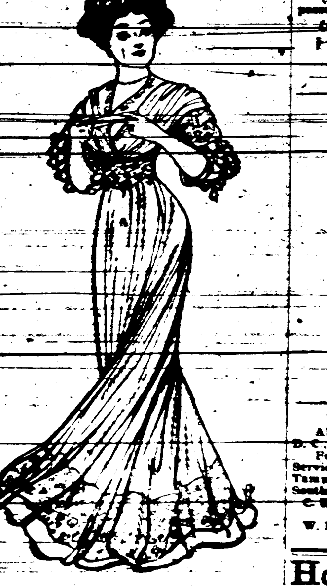
SHORT WANTED EFFICIENT.

Scientific American, MUNY & Co., New York.